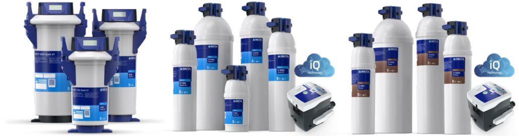
PURITY Quell ST

This is an overview of the complete range of PURITY filtration products, designed specifically for use in vending machines. BRITA Professional has the right solution for you, providing the ideal water for your needs – no matter what the composition of your mains supply.